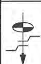
EXHIBIT "A" SHEET 5 OF 5 SHEETS