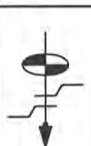
EXHIBIT "A" SHEET 1 OF 5 SHEETS