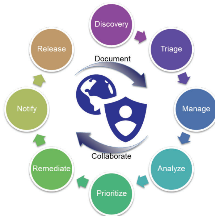
Figure 2—Product Security Incident Response Team (PSIRT) Workflow

If an event were to occur where a customer's data being managed by Esri was confirmed breached, Esri will contact the customer within 72-hours. Esri will coordinate with appropriate parties to investigate the security breach and perform remediation as necessary. Esri will provide updates to the customer with applicable information on a mutually agreed-on schedule. Esri does not inform any third party of a breach of a customer's information and data without first obtaining the customer's prior written consent, unless required by law or court order.