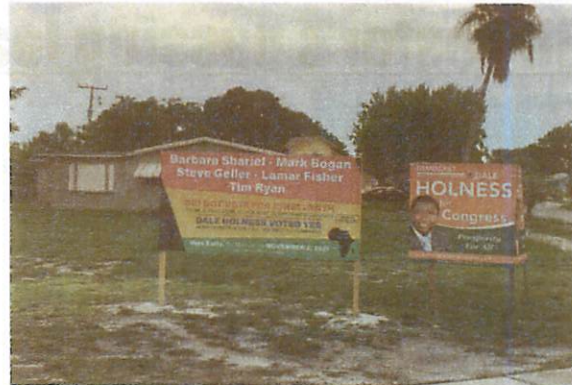
Signs erected in Ft. Lauderdale & Miramar

Because the substitute motion passed, the Commission never voted on the original motion.