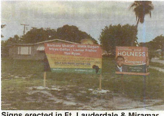
Signs erected in Ft. Lauderdale & Miramar

Because the substitute motion passed, the Commission never voted on the original