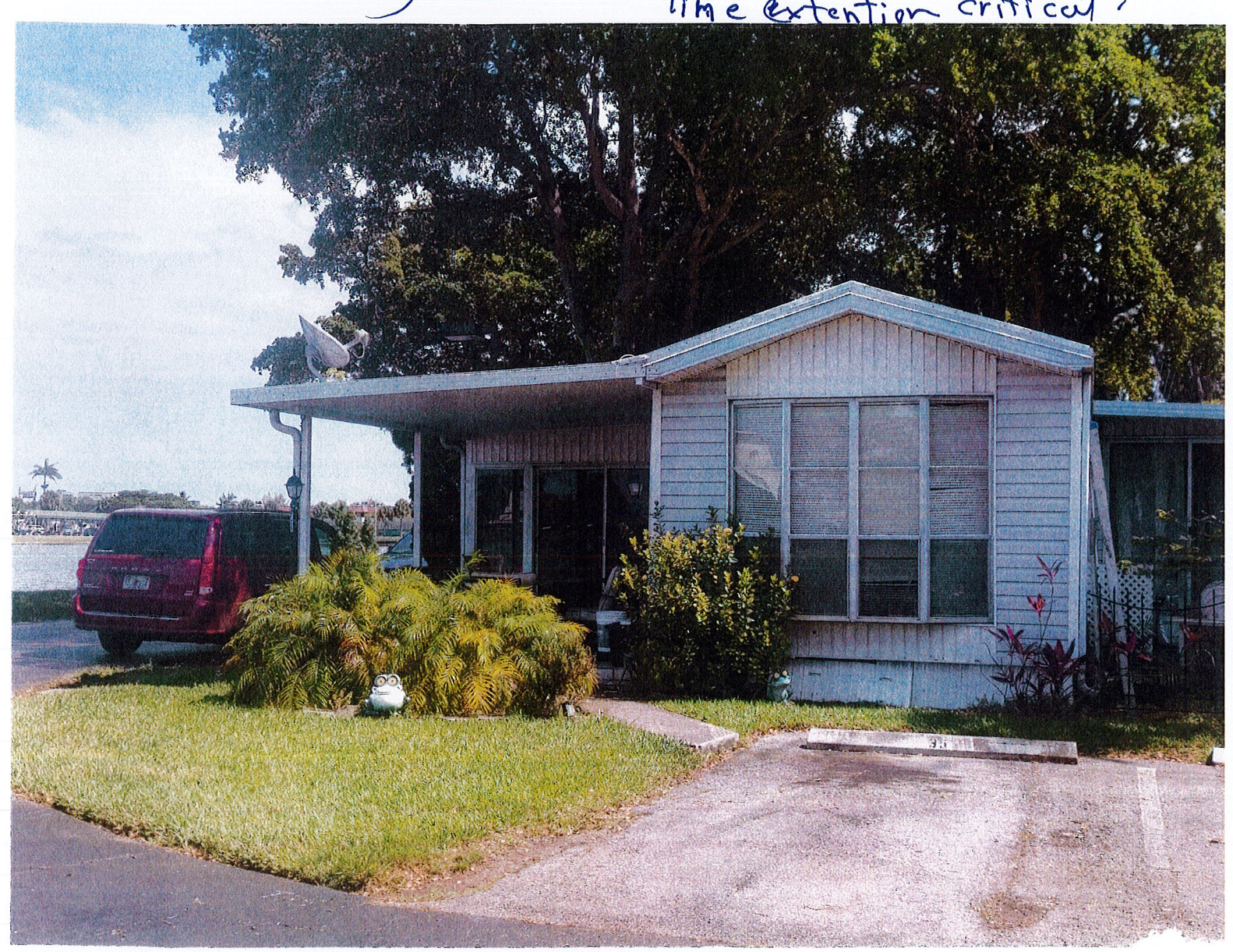
Family homes to be evacuated. Home For Christmas. Homeless For the New Year?!!

Few find their way others stranded options are few. Time extention critical.