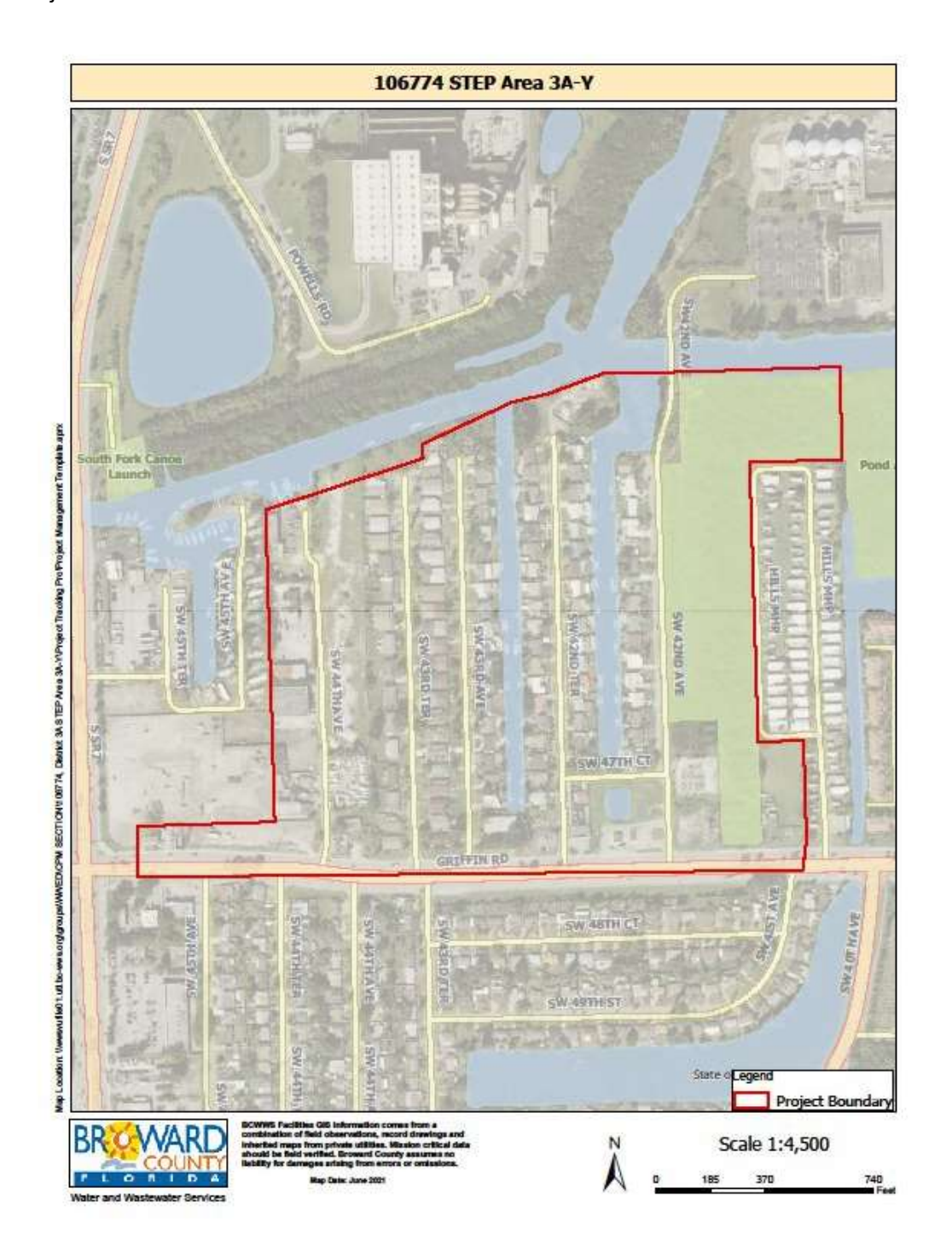
Project 1: 106774 STEP Area 3A-Y