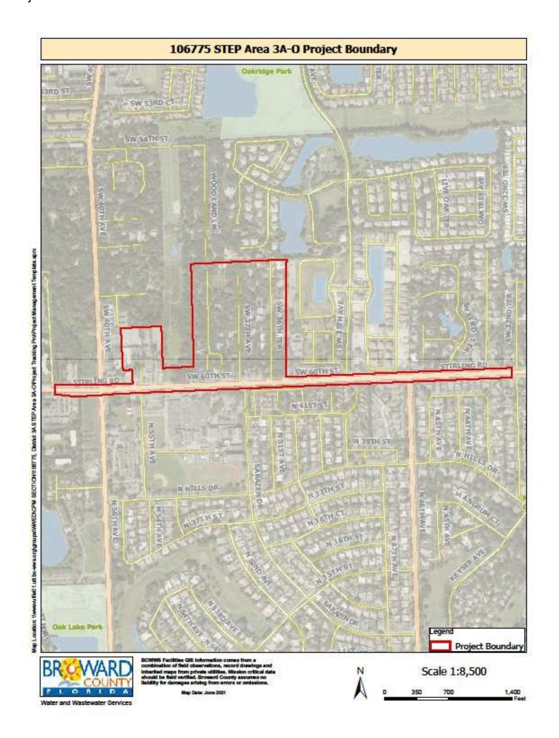
Project 2: 106775 STEP Area 3A-O