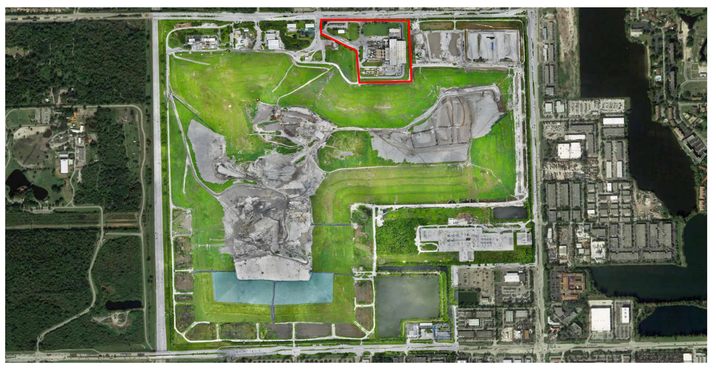
Exhibit 5 Page 3 of 18