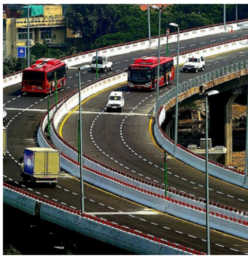
BANGLADESH AMERICAN CHAMBERS OF COMMERCE, FL