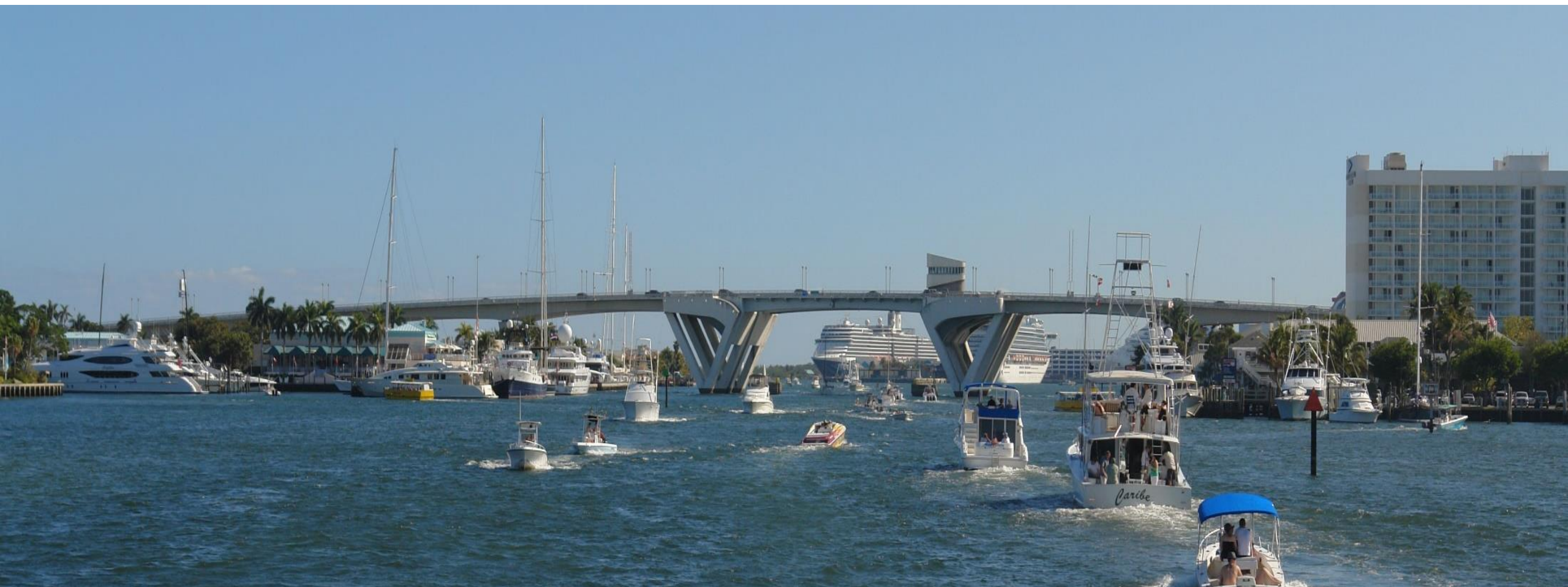
E. Clay Shaw, Jr. Bridge