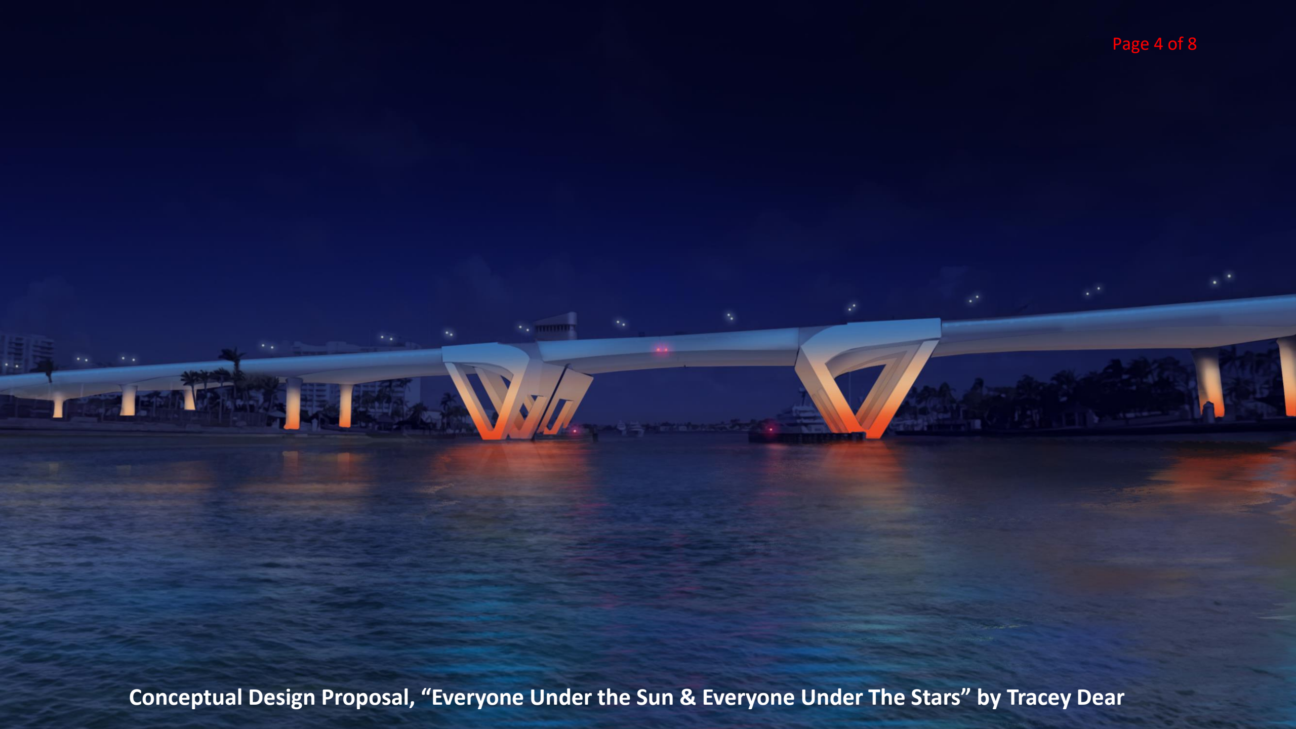
Conceptual Design Proposal, “Everyone Under the Sun & Everyone Under The Stars” by Tracey Dear