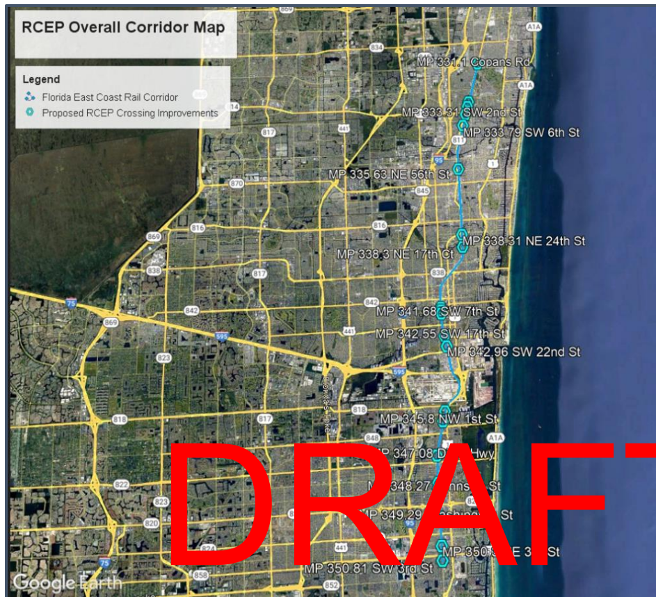
Figure 1 – Project Location Map

NOT INTENDED FOR EXECUTION WITHOUT MODIFICATION