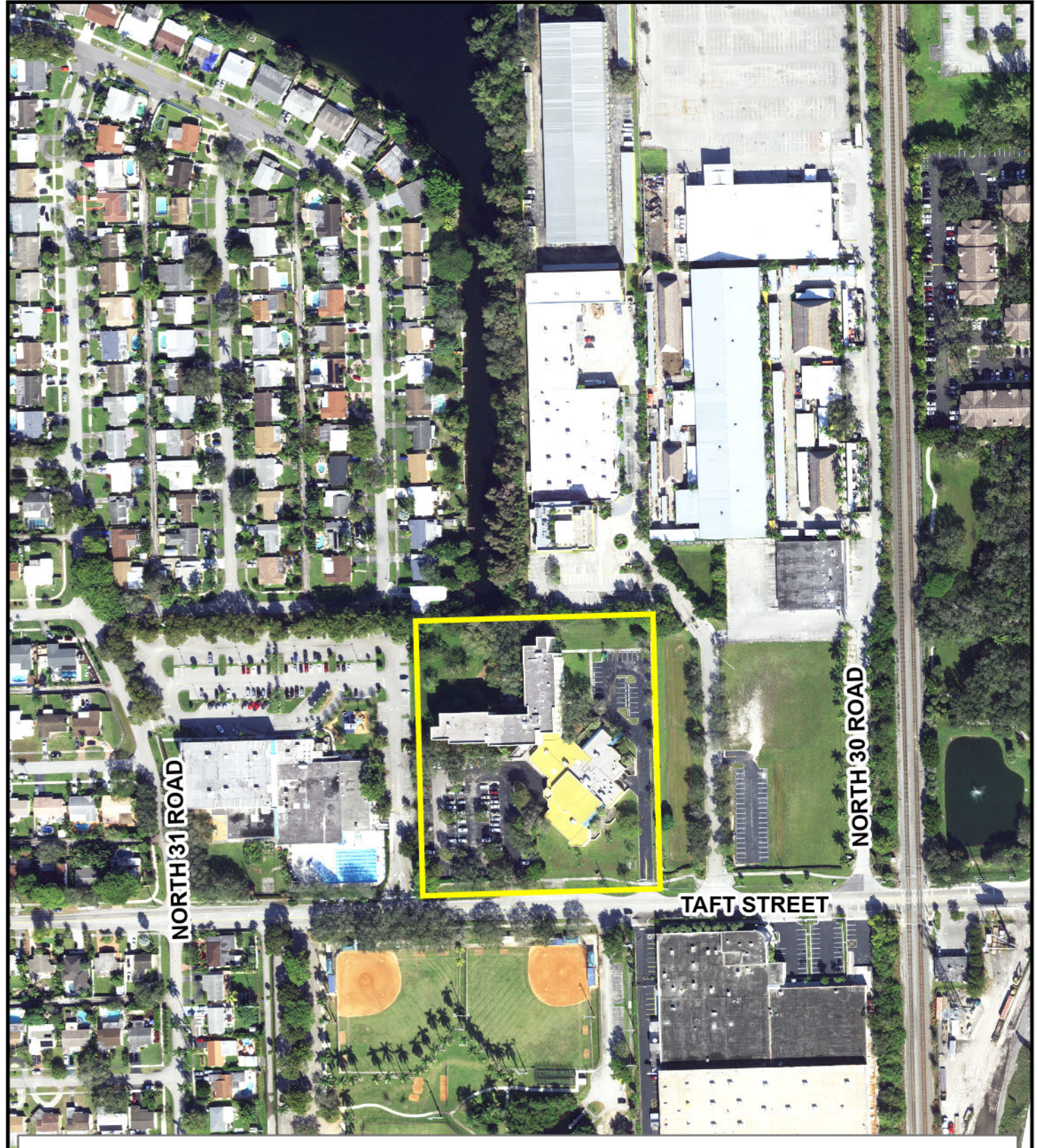
Exhibit 2 Page 1 of 1

Commission District No. 2 Municipality: Hollywood S/T/R: 8/51/42