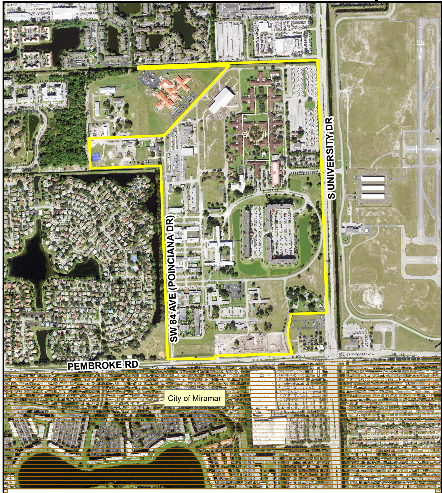
Exhibit 2 Page 1 of 1

Commission District No. 7 Municipality: 16 & 21/51/41 S/T/R: Pembroke Pines