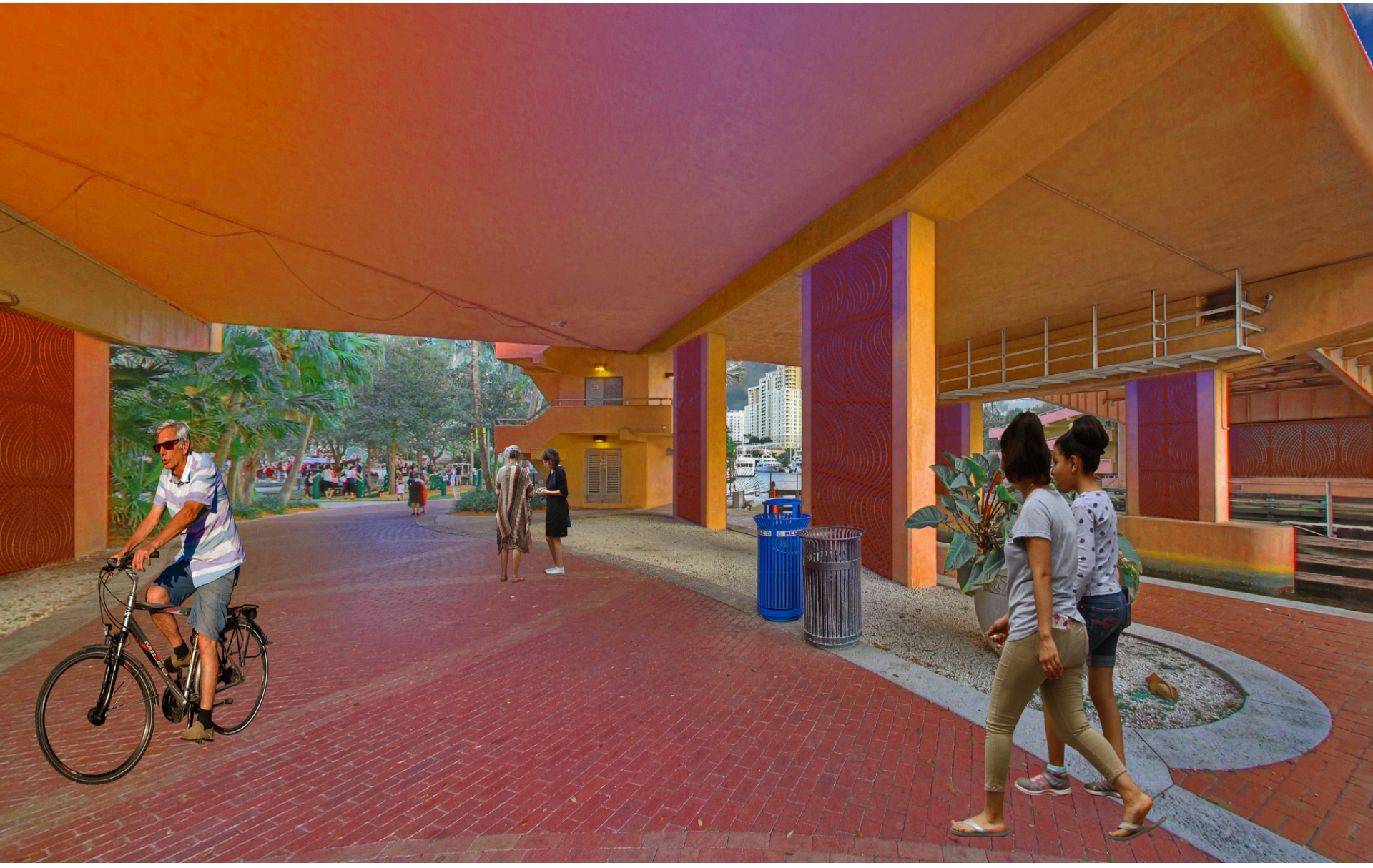
EXHIBIT 1 Page 6 of 6