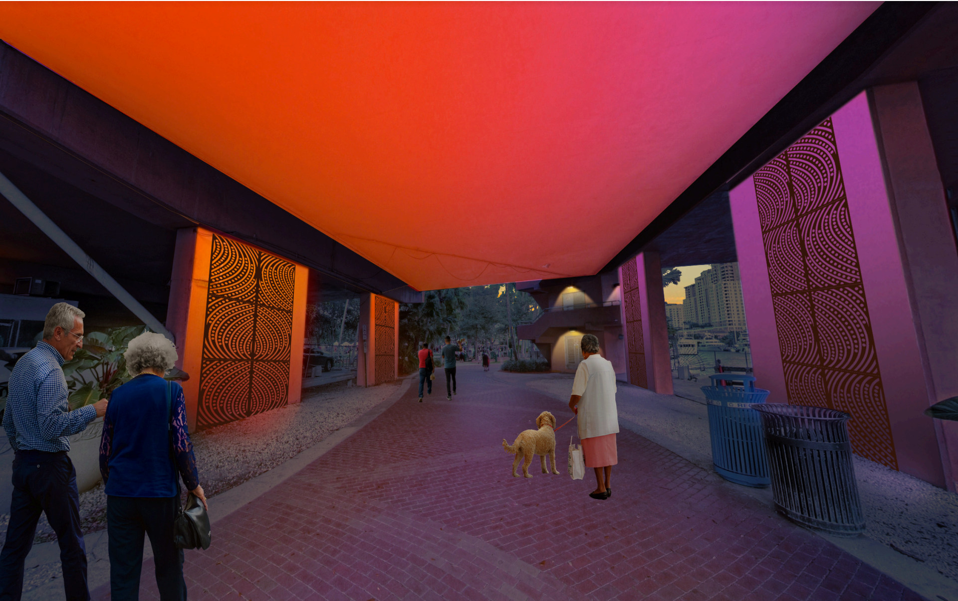
EXHIBIT 1 Page 5 of 6

Pedestrian areas will be lit at night and by day