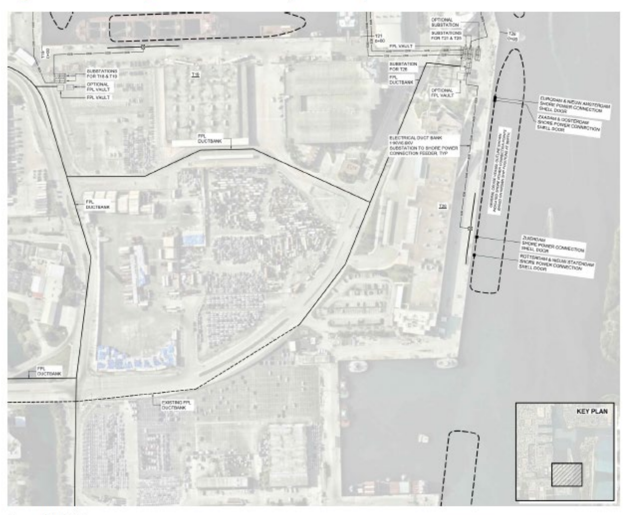
Figure 5-4. CT26 Enlarged Electrical Site Plan (Sheet E113)