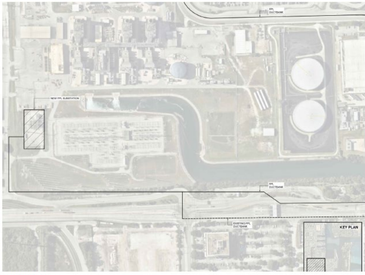
Figure 5-6. Enlarged Electrical Site Plan for FPL New Substation (Sheet E115)